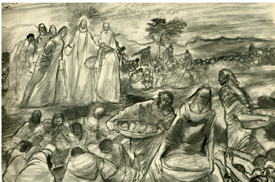
"The Miracle of the Bread," by Edouard Léon Louis Edy-LeGrand, 1950

∞ Keeping the heart of the University listening to the heart of God ∞