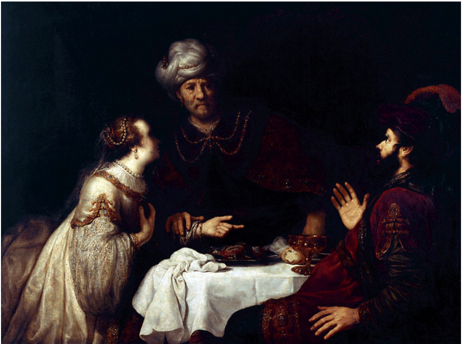
"Esther and Haman before Ahasuerus," by Jan Victors, 1639.

∞ Keeping the heart of the University listening to the heart of God ∞